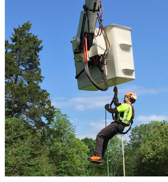
LEGAL REQUIREMENTS OHSA Section 25(1)(c), 2(a)(c)(d)(h)Regulation 213/91 Section 17,21(3)